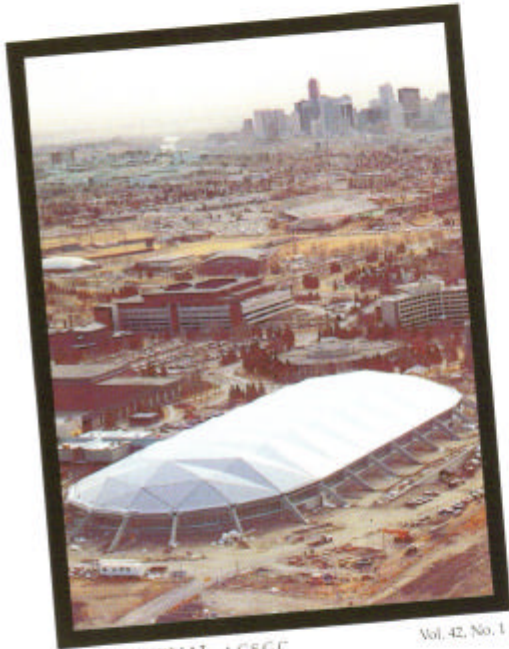
CISM JOURNAL A CSGC